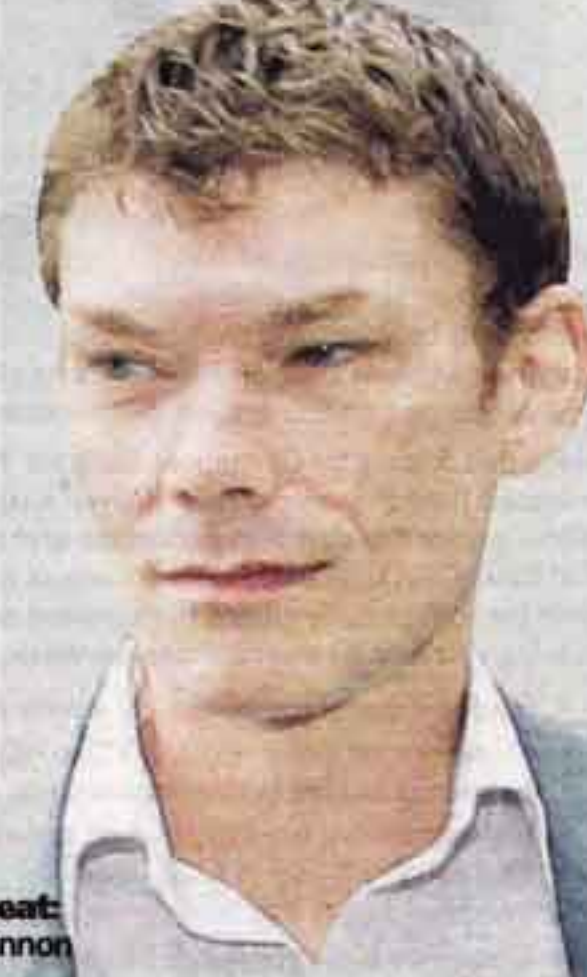
US jail threat: Hacker McKinnon

Riot: Chicago was a battleground some of the song's lyrics refer to their trial. They read: So your brother's bound and gagged And they've chained him to a chair Won't you please come to Chicago just to sing In a land that's known as Freedom How can such a thing be fair... It's dying - if you believe in justice It's dying - and if you believe in freedom It's dying - let a man live his own life It's dying - rules and regulations Who needs them, open up the door