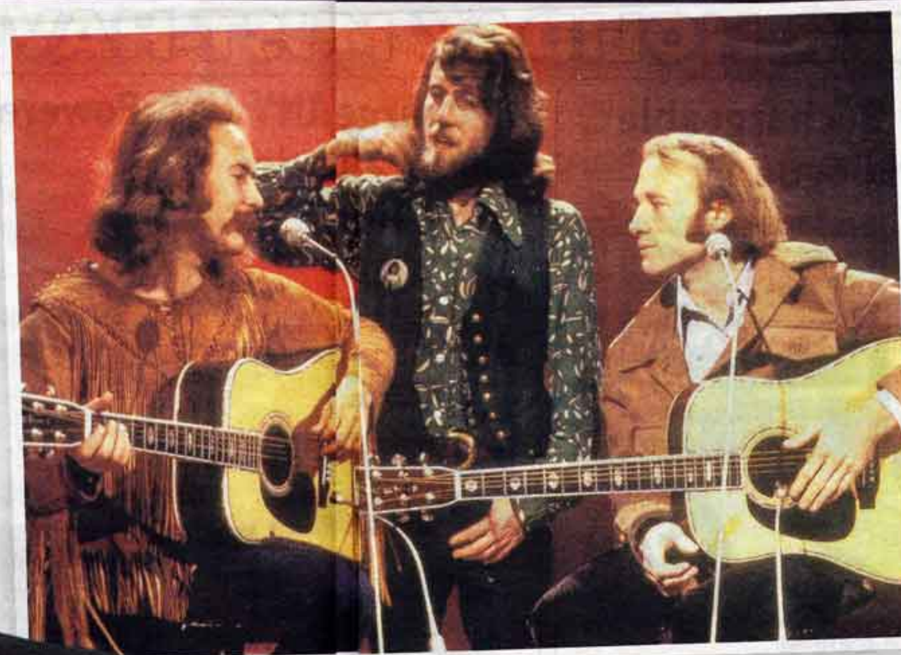
Top trio: Graham, centre, with Crosby and Stills in their heyday, played Woodstock