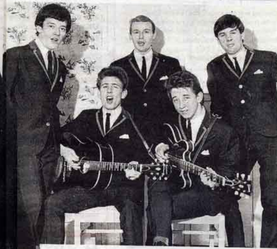
60s success: Nash, second left, had 22 hits with The Hollies

give it a three-part harmony. We knew we had something special." The trio auditioned for Apple Records, the label founded by The Beatles, but they were turned down flat by George Harrison. Nash said: "I've not got a clue why he turned us down because we were great. We weren't too crushed because we knew we had something unique." The group were later snapped up by US record mogul Ahmet Ertegun for his Atlantic Records label. They played their second gig - with mate Neil Young - at the Woodstock Festival in 1969, sharing a bill with The Who, Jimi Hendrix and Santana. Nash said: "The event had a great energy from 400,000 kids who turned up to say love is better than war." Highlights of Crosby, Stills And Nash's career include classic hits such as Love The One You're With , Wooden